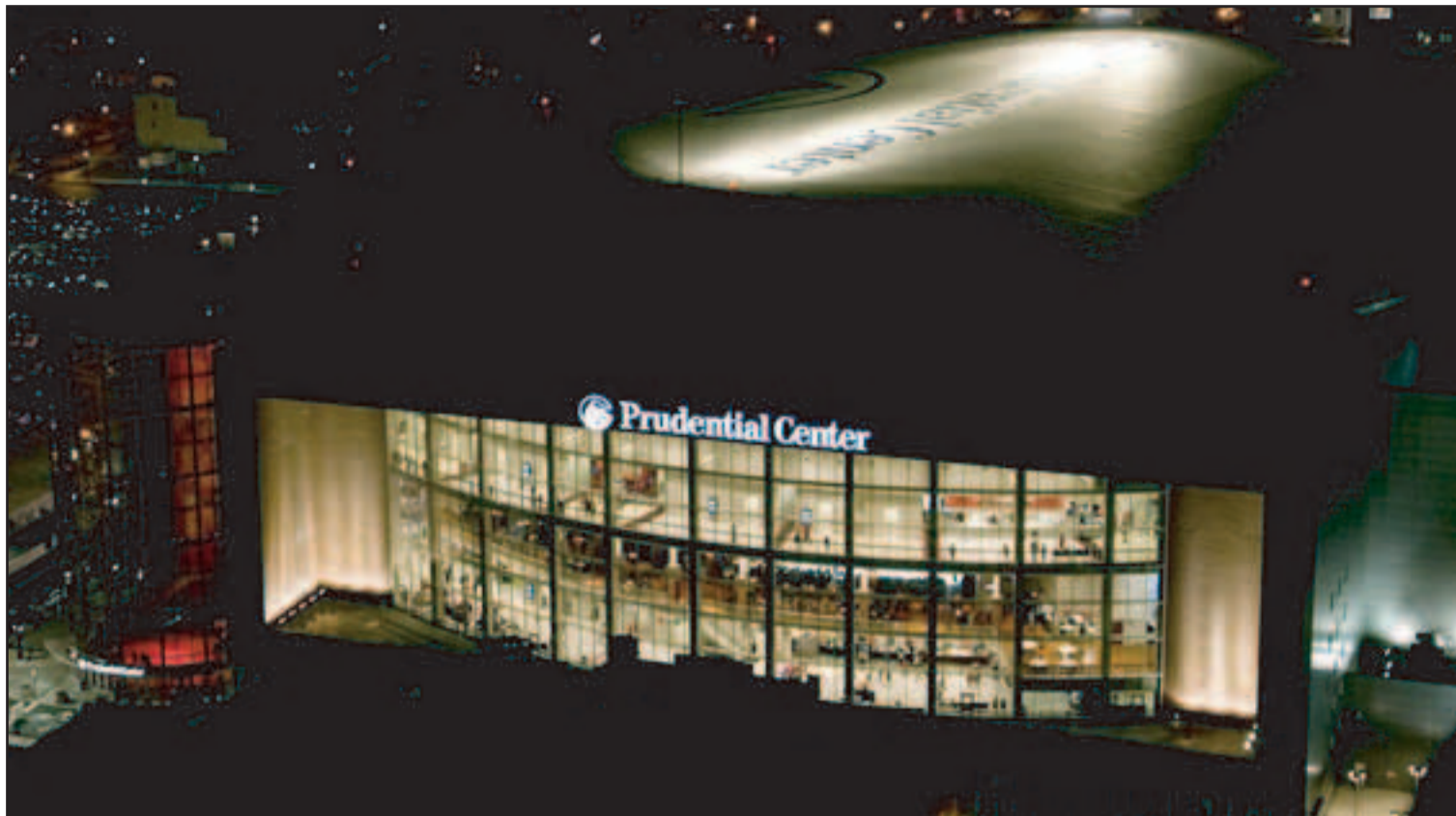
Newark's Prudential Center will be the site of this year's Devils Draft Party.

The 2008 New Jersey Devils Draft Party will take place Friday, June 20, from 7 p.m. to 10 p.m.