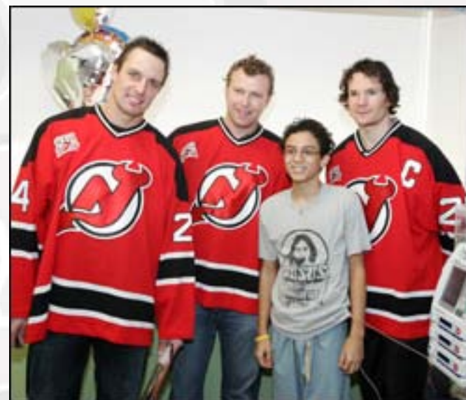
Dec. 4, 2006: Richard Matvichuk, Martin Brodeur, and Patrik Elias visit the pediatric ward of Saint Barnabas Medical Center. view photo gallery